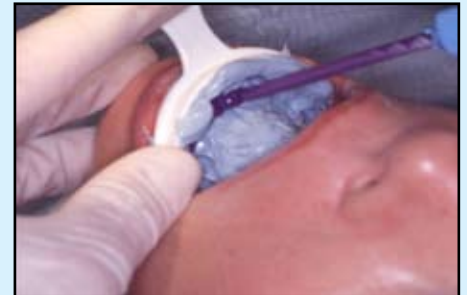
6. First Quarter Light Body Fast Set is syringed into the tray in the prep areas in a thin layer. Maximum working time is 15 seconds.