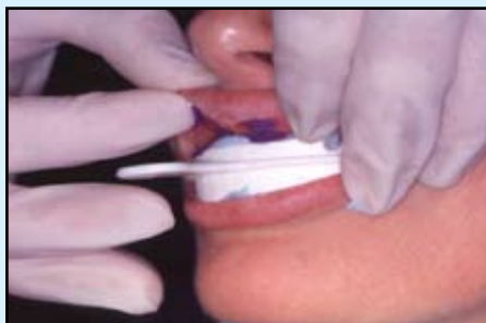
7. The patient closes; this exerts hydraulic force on the light impression material.