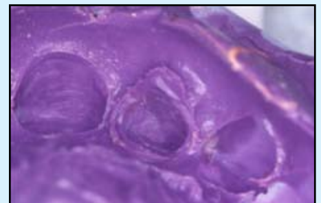
9. A closer view shows perfect detail where the Light Body fast Set is incorporated into the impression.