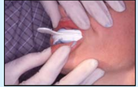
1. Patient requires a new crown on upper right central. Preparation is completed.