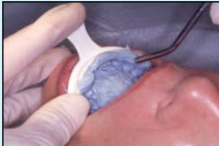
5. The impression is spray washed & dried while in the mouth.