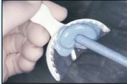
2. Fill Polybite Anterior Tray with First Quarter Heavy Stiff Bite. Fill prep side to regular level; fill opposing side with 30% more material. Maximum working time is 20 seconds.