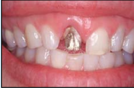
1. Patient requires a new crown on upper right central. Preparation is completed.

H & H may be done trayless by the same technique except that a stray is not used to deliver the Stiff Bite for the initial impression. Instead, the Stiff Bite is injected directly into the mouth. The patient closes and the tongue is rested against the Stiff Bite, effectively forming the preliminary impression. Another variation is to inject the light body onto margin areas only; the patient closes the clean and dry Stiff Bite onto the Light.