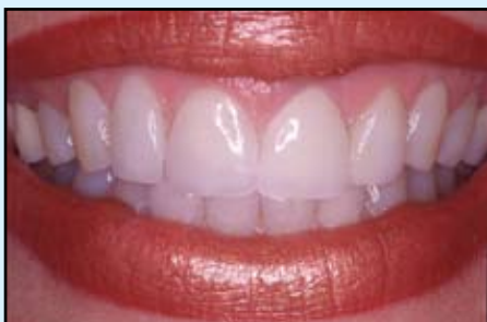
10. The H & H technique achieves an impression of the prep, the opposing teeth & a bite registration ALL-IN-ONE.